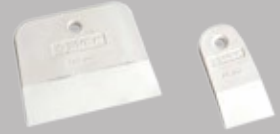
Rubber putty knife