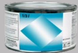
Fine grain water-soluble filler