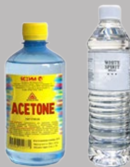
Acetone. White spirit