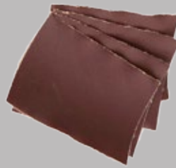
Fine grain abrasive paper