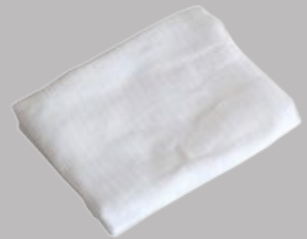
Cotton waste (Cloth)