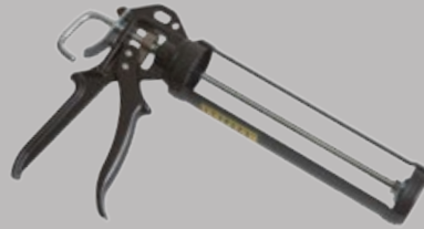
Glue applicator gun